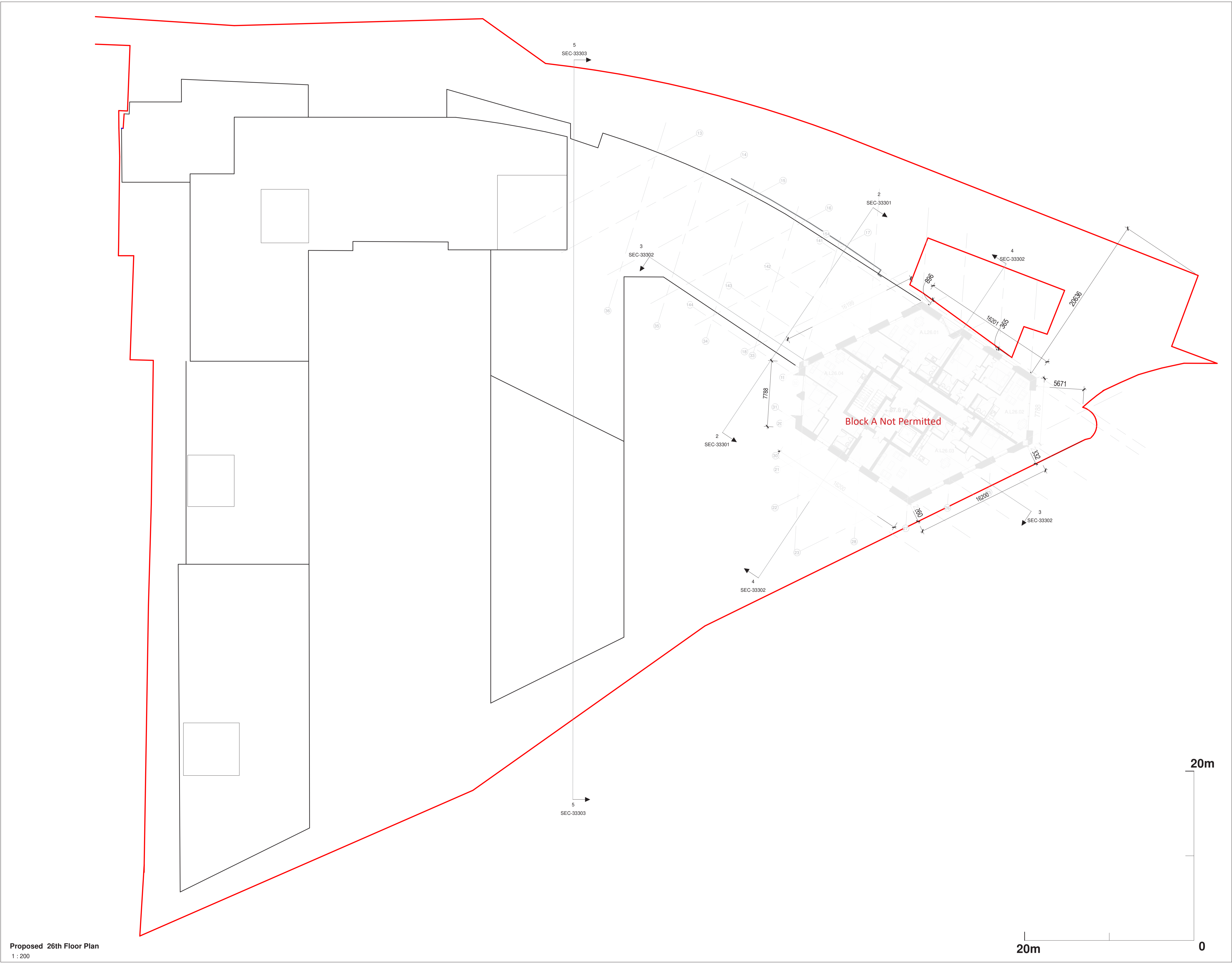
Proposed 26th Floor Plan 1 : 200